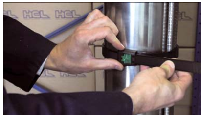
Smart Tie™ and SM-FT-2000-19 Hand Tool

Demonstration videos are available to view on our website.